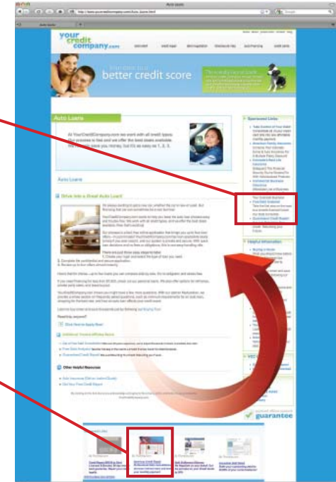
Ad #2 Thumbnail Image

Eliminate Your Debt Today Professional debt consolidation: decrease interest rates and lower your monthly payment